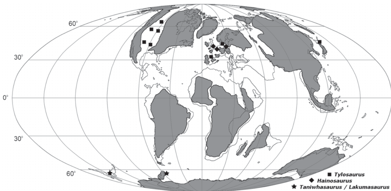
Fig. 3.—Palaeobiogeographical distribution of the tylosaurine genera Tylosaurus , Hainosaurus and Taniwhasaurus / Lakumasaurus . Main data from Caldwell et al. (2005), Everhart (2005), Lindgren (2005), Lindgren & Siverson (2002), Lingham-Soliar (1992), Novas et al. (2002). Map after Smith et al. (1994).

animals in either hemisphere, all their remains having been unearthed into a palaeolatitudinal belt included between 40–70° (fig. 3). On other words, no latest Cretaceous tylosaurines are known from subtropical to equatorial latitudes (30–0°). As for some living marine mammals, this distribution is probably linked to palaeoecological preferences (Bardet, 2004).