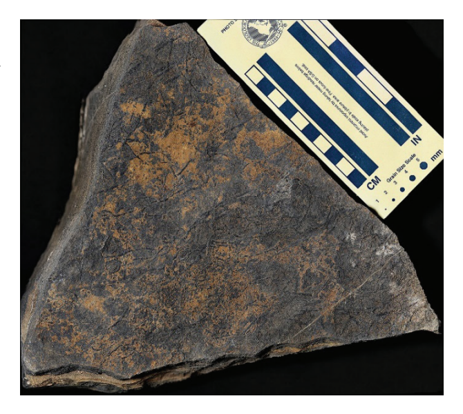
Fig. 1.– Cloudina preserved as long serpentine strings of funnelin-funnel shells in microbialites mounds of the Pockenbank Member on Arasab Farm in southern Namibia south of Aus. This preservational window – suggesting that the organism grew recumbently along the mat surface and thus did not require structural support for orientation in currents – is remarkably similar to that of Cloudina in Ediacaran successions of Brazil (Becker-Kerber et al. , 2017). In cross sections of the mounds, it is clear that both metazoans and microbes collaborated in the construction of reefs ( contra Mehra & Maloof, 2018).

The occurrence of Cloudina immediately above the dolomitic Mara Member is critical insofar as this unit preserves evidence for the greatest negative carbon isotope anomaly in Earth history – the Shuram Excursion – when Ediacaran oceans were broadly ventilated and oxic conditions likely prevailed in shallow marine environments near the end of the environmental perturbation. Given the global distribution of the Shuram Excursion, its stratigraphically cohesive pattern of carbon, sulfur, and strontium isotope change, and its preservation in a wide range of depositional lithofacies (Grotzinger et al. , 2010), the carbon isotope excursion may be understood in terms of the pulsed addition of <sup>12</sup>C-rich alkalinity to the oceans (Kaufman et al. ,